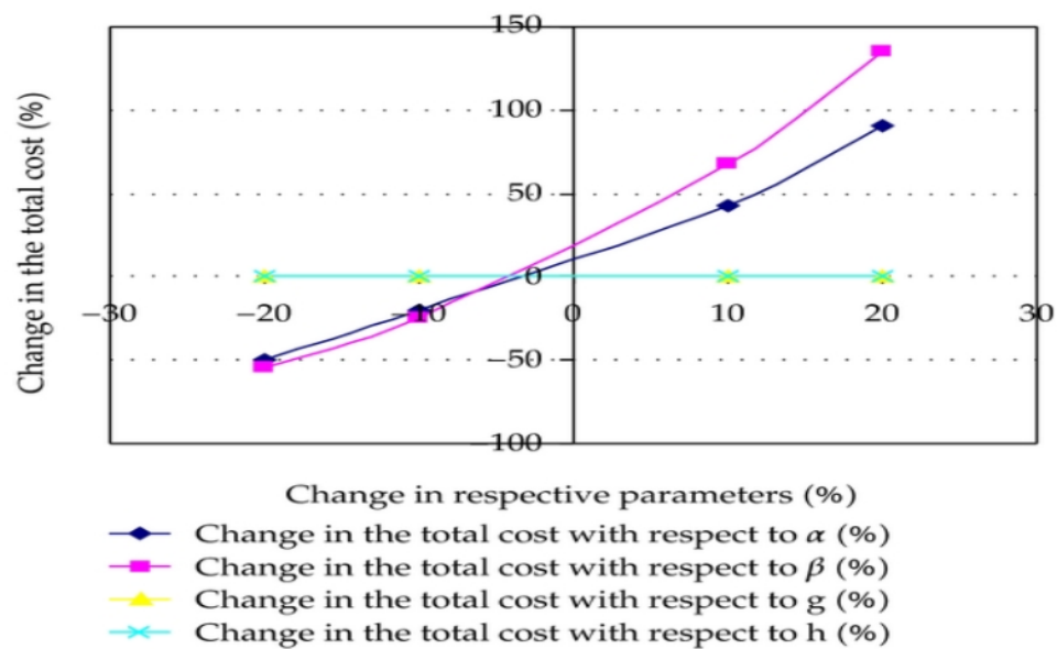
Figure.1: Inventory model analysis, (Source: https://static-02.hindawi.org )

The data analysis has presented the comparison regarding the change in cost as per the Inventory fluctuation. From the above graph, the level of the inventory parameters is increasing at the level of 150, which is impacted by the ratio of changes in total cost. On the other hand, after a certain period, it has seemed that the curve of total cost parameters is going from the level of -10 to -50. This is occurring to the effect of the Fixed Recorder system in the Inventory position.