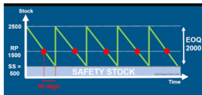
Figure 3: Safety Stock Level

which records the data or events that are occurring manually way. The second component is a controller, which is responsible for adjusting the recorder settings and ensuring that the data collected is accurate. Finally, the third component is the software used to store and analyse the data collected. The recorder period system is beneficial because it allows for the collection of accurate data over long periods of time. This system can be used to monitor seismic activity, meteorological data, or any other type of data that needs to be monitored over a long period of time. Additionally, the recorder period system is relatively easy to set up and maintain. Overall, the recorder period system is a useful system for monitoring data or events over long periods of time. This system is relatively easy to set up and maintain and can be used for a variety of purposes. Additionally, the data collected is accurate and reliable, making the recorder period system an invaluable tool for any organization that needs to monitor data or events over a long period of time.